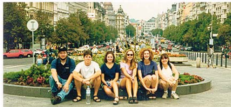
Students in Prague